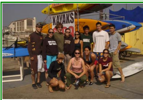
Club members getting ready to go in the water.