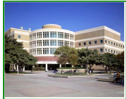
Frederick Reines Hall UC Irvine

We hope that the fume hood campaign will contribute towards UC Irvine's awareness in energy conservation and we look forward to seeing the results!