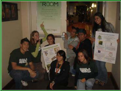
Members of the Green Campus Program at the Green Room reception.