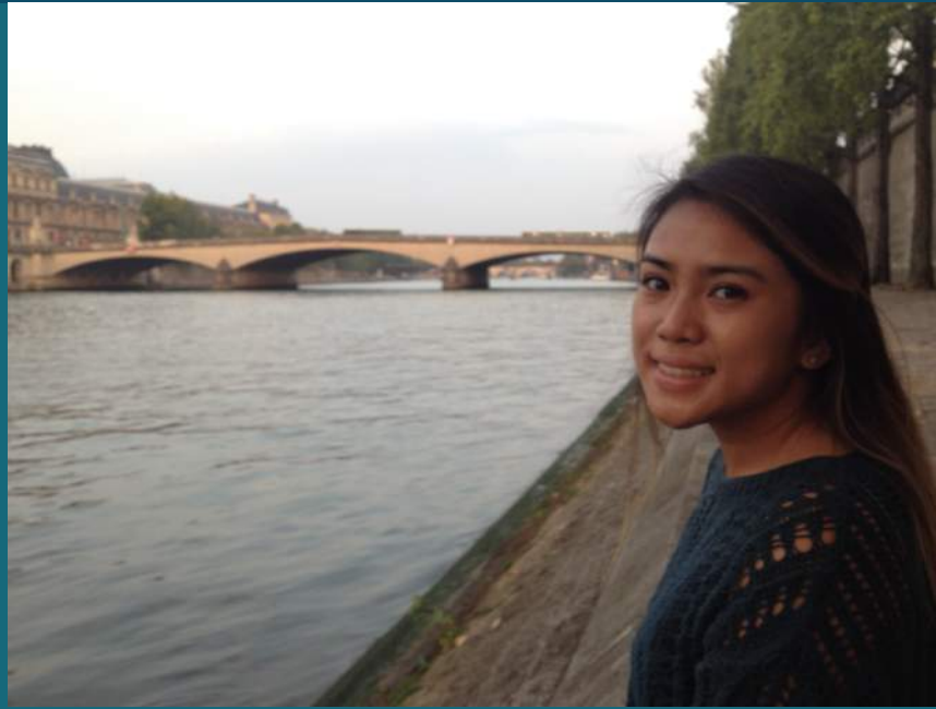
Seine River, Paris, France

Bonjour, tout le monde! It's hard to believe I was in Europe less than a month ago. I was studying abroad in Paris, France this past fall semester. It's hard to sum up my experience in just a few paragraphs. With my classes and homestay experience, I immersed myself in Parisian and French culture, learned about the country's history, met and talked to Frenchies, ate amazing food, and visited neighboring countries. There was so much to learn and do, there was never a dull day.