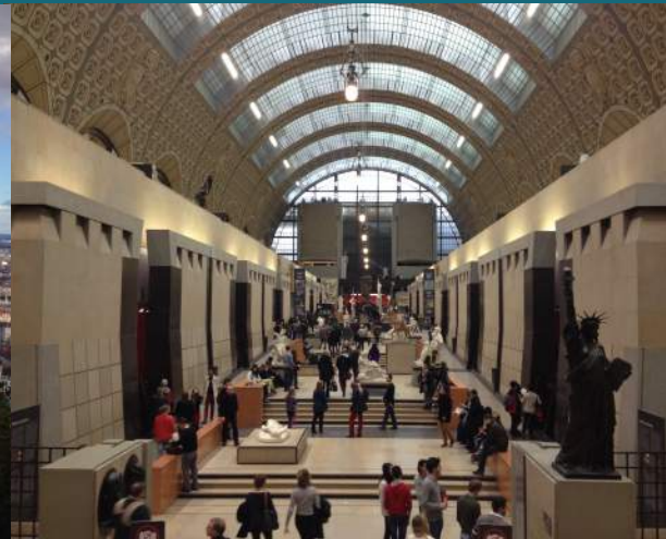
Left to Right: Eiffel Tower, Paris, France; Lyon, France; Musee d'Orsay, Paris, France.